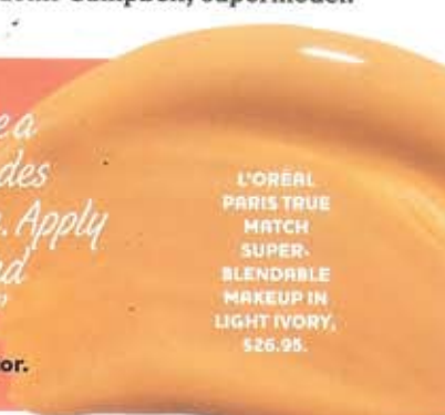
L'ORÉAL PARIS TRUE MATCH SUPER-BLENDABLE MAKEUP IN LIGHT IVORY, $26.95.